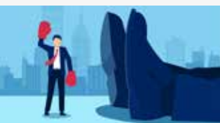
BTI Consulting Midsize Heavyweight 2020